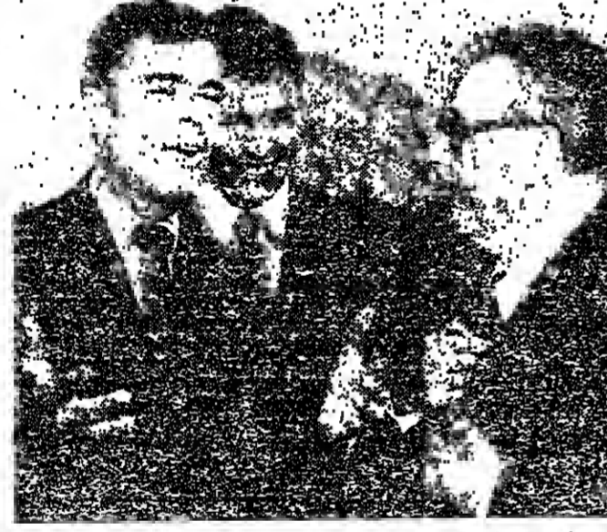
Moscow mirth: Mr Block, left, and Mr Patolichev after the signing of the grain agreement.

Mr John Block, the American Agriculture Secretary, yesterday met Mr Geidar Aliyev, the Soviet Deputy Prime Minister, in what is seen as a further move towards easing Soviet-American relations.